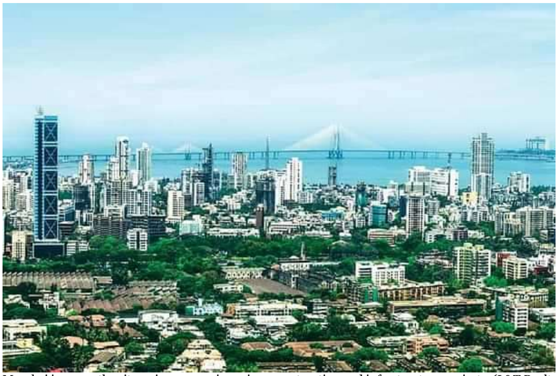
Mumbai is currently witnessing a surge in various construction and infrastructure projects.

Mumbai's Infrastructure Leap: Major Projects Set To Transform The City In 2025 The Business Standard, January 02, 2025