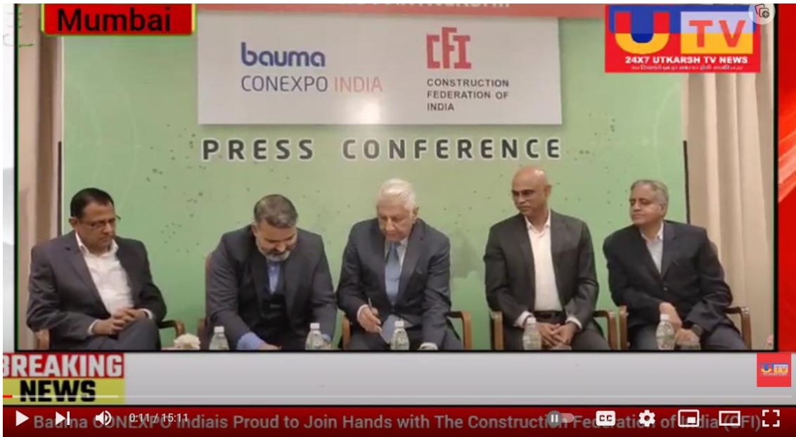
Press Conference Bauma CONEXPO India is proud to join hands with the Construction Federation of India