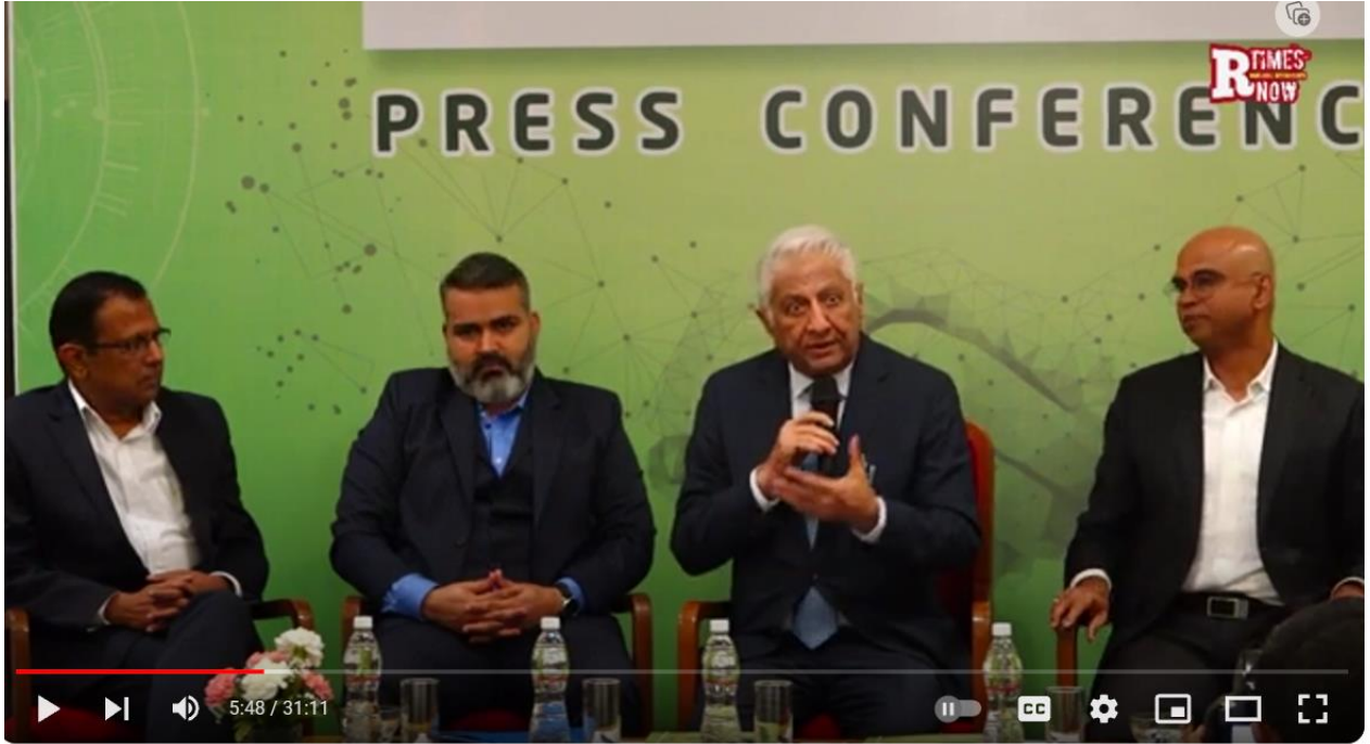
sauma CONEXPO India is proud to join hands with the Construction Federation of India (CFI)