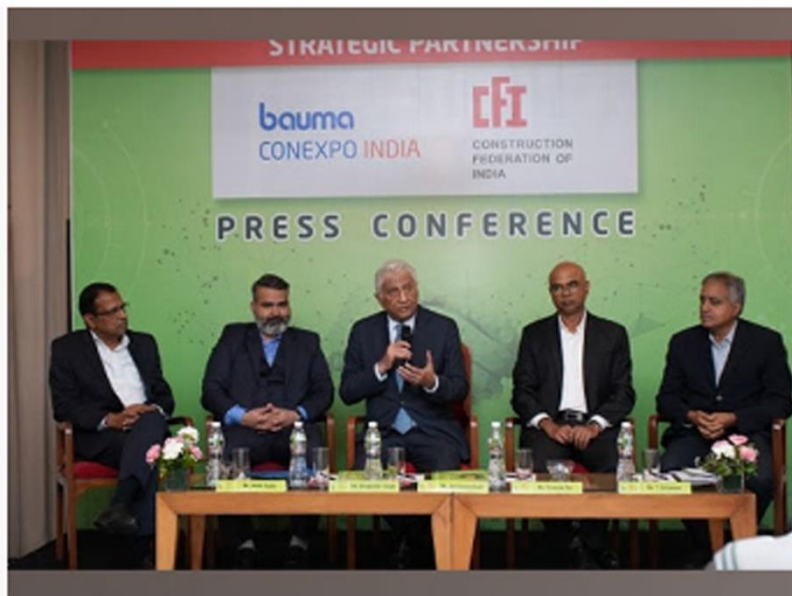
bauma CONEXPO India is Proud to Join Hands with the Construction Federation of India (CFI) for its 2024 Edition