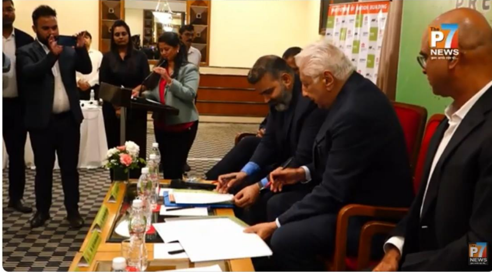
bauma CONEXPO India is proud to join hands with the Construction Federation of India (CFI)