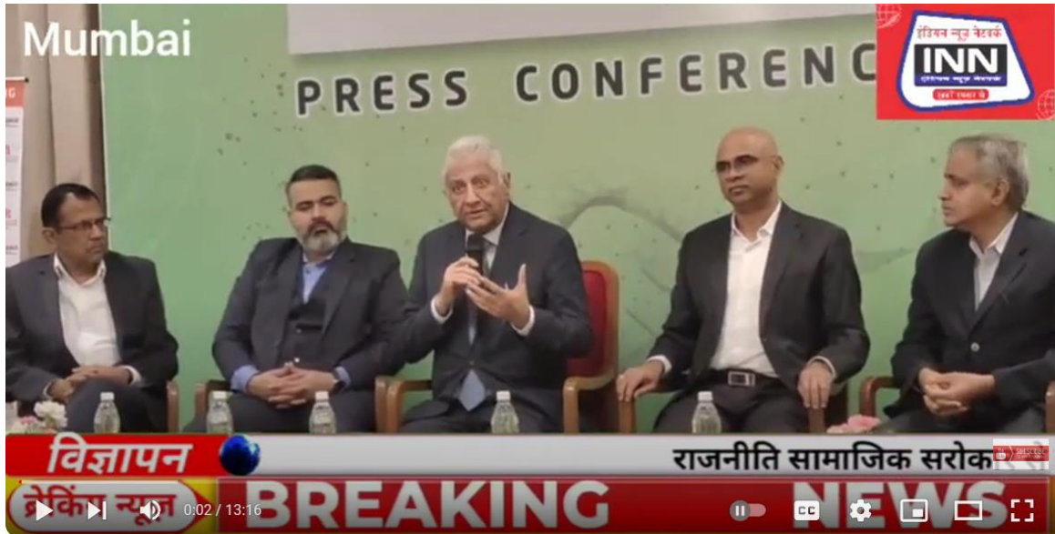
Bauma CONEXPO India is proud to join hands with the Construction Federation of India (CFI)