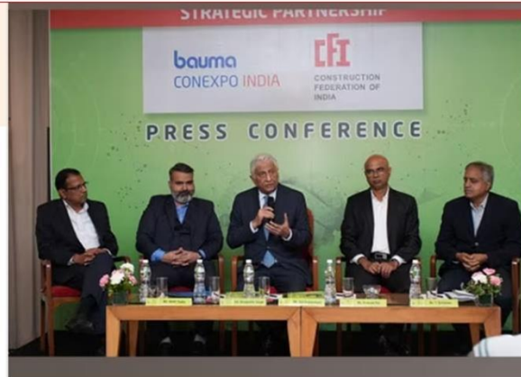
bauma CONEXPO India is proud to join hands with the Construction Federation of India (CFI) for its 2024 edition

Mumbai (Maharashtra) [India], December 23: bauma CONEXPO India is excited to collaborate with the Construction Federation of India (CFI) for its upcoming 7th edition in North India. One of the premier industry associations in the country, representing the largest construction companies across India, CFI will join hands with bauma CONEXPO India 2024 to promote the issues of tax rationalization, safety and sustainability of construction projects, and skill development in line with Industry 4.0 technologies.