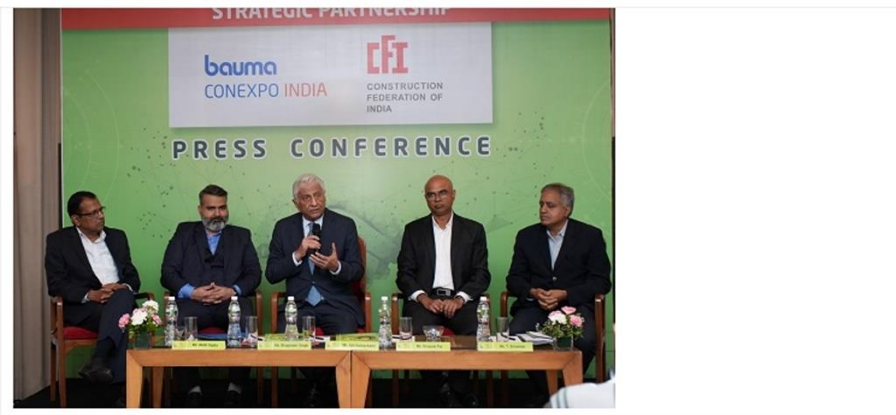
bauma CONEXPO India is proud to join hands with the Construction Federation of India (CFI) for its 2024 edition

bauma CONEXPO India is excited to collaborate with the Construction Federation of India (CFI) for its upcoming 7th edition in North India. One of the premier industry associations in the country, representing the largest construction companies across India, CFI will join hands with bauma CONEXPO India 2024 to promote the issues of tax rationalization, safety and sustainability of construction projects, and skill development in line with Industry 4.0 technologies.