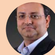
Late Mr. Cyrus Mistry, Ex - Managing Director Shapoorji Pallonji Group